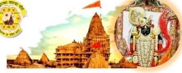
Paschimamnaya Sharada Peetha-Dwaraka