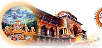
Uttaramnaya Jyotish Peetha-Badari