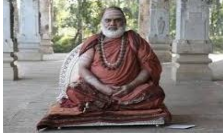
Poojya H.H Swami Bharati Teertha Ji Maharaj Sringeri