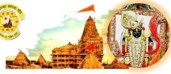
Paschimamnaya Sharada Peetha-Dwaraka