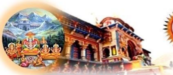
Uttaramnaya Jyotish Peetha-Badari