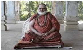
Poorva Paksha (4) Poojya H.H Swami Bharati Teertha Ji Maharaj Sringeri