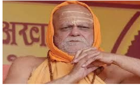
"Nirnaya Karta" Poojya H.H Puri Jagadguru Shankarachaya Swami Sri Nischalananda Saraswati Maharaj

( jyotirmathbadari@gmail.com ) with their signature, the very next day 16 th day from now According to Adi Shankaracharya's Mathamnaya Mahanushasanam (Law), and Dharma Shastra you will be ( All 4) 5 th time will declared as "Fake Babas" and resolution will be passed, you will be expelled from Sadhu Sant Samaj and all the reports will be submitted to the all Sant Samaj and even to Courts, district , State High Court , Supreme Court,